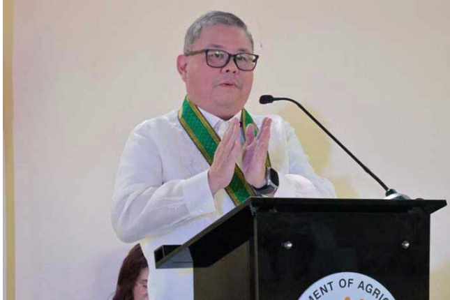
Agriculture Secretary Francisco Tiu-Laurel Jr.