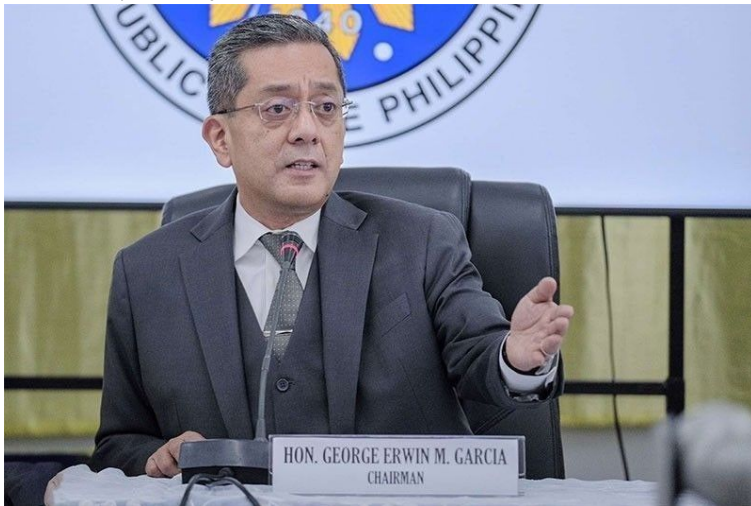
Commission on Elections (Comelec) Chairman George Garcia on July 17, 2024.