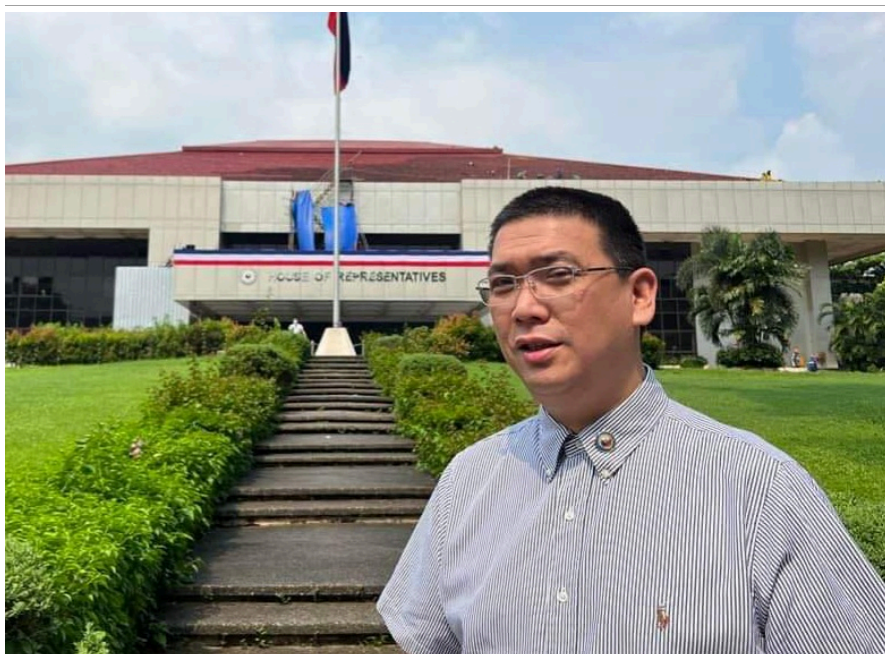
AGRI Party-list Rep.