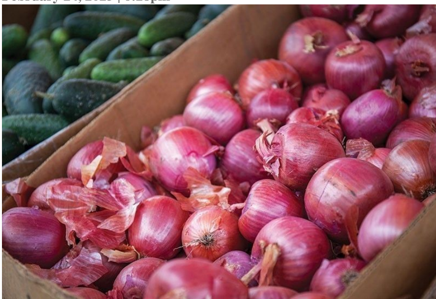
Undated photo shows a box of red onions.