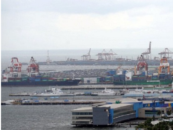
South Harbor in Manila