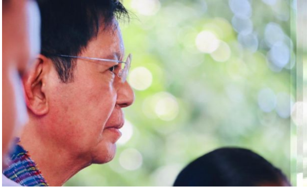
Former Senator Panfilo “Ping” Lacson (File photo)

“Why is Rep. Stella Quimbo afraid to tell the truth if there are blanks in the 2025 Budget? She should know. She is the newly installed Chair of the Committee of Appropriations. She was part of the Bi-Cam. Is she hiding the truth?” Tañada asked in a tweet last Friday.