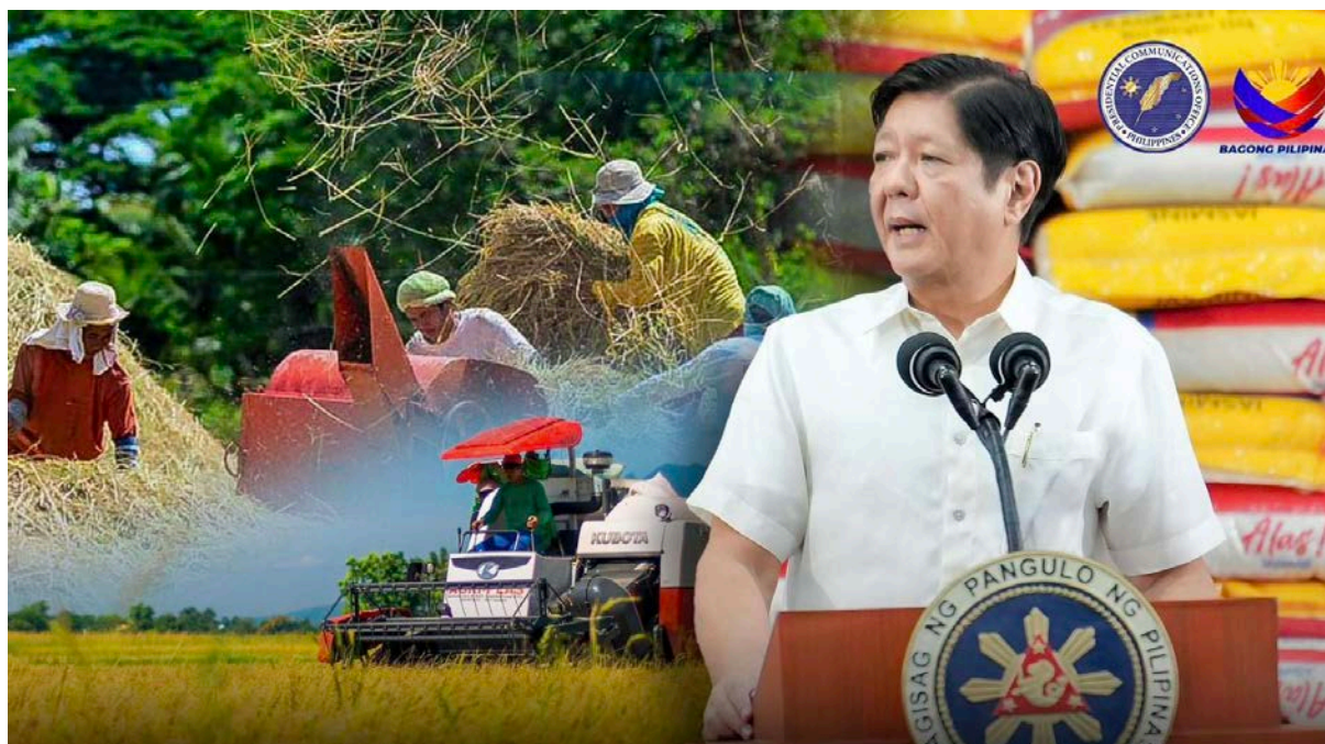
President Ferdinand 'Bongbong' Marcos Jr.

The Department of Agriculture (DA) maintained that there is no rice supply shortage in the country despite the recommendation to declare a food security emergency.