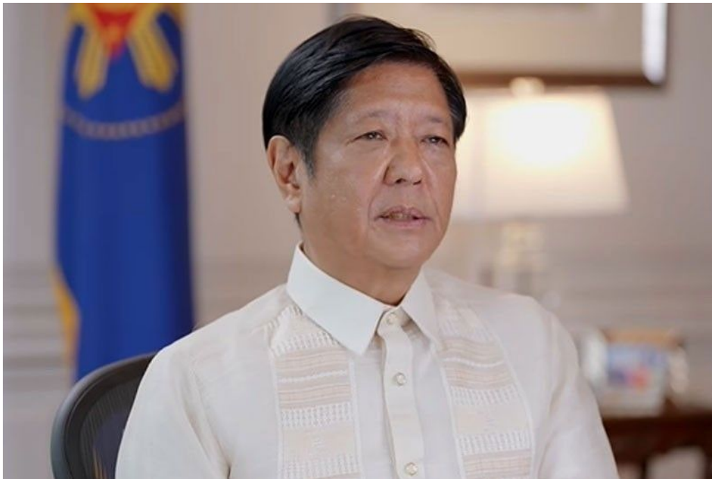
President Ferdinand Marcos Jr