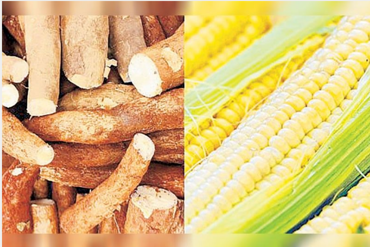
Composite photo of harvested corn and cassava.