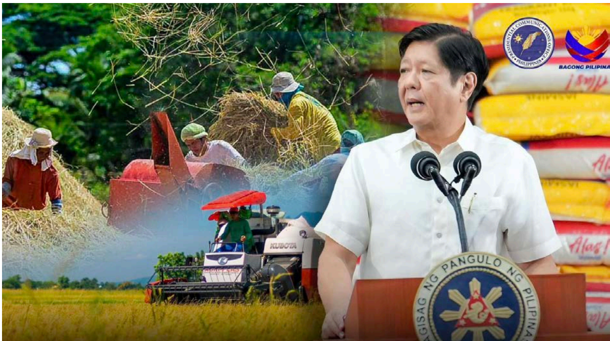
President Ferdinand 'Bongbong' Marcos Jr.