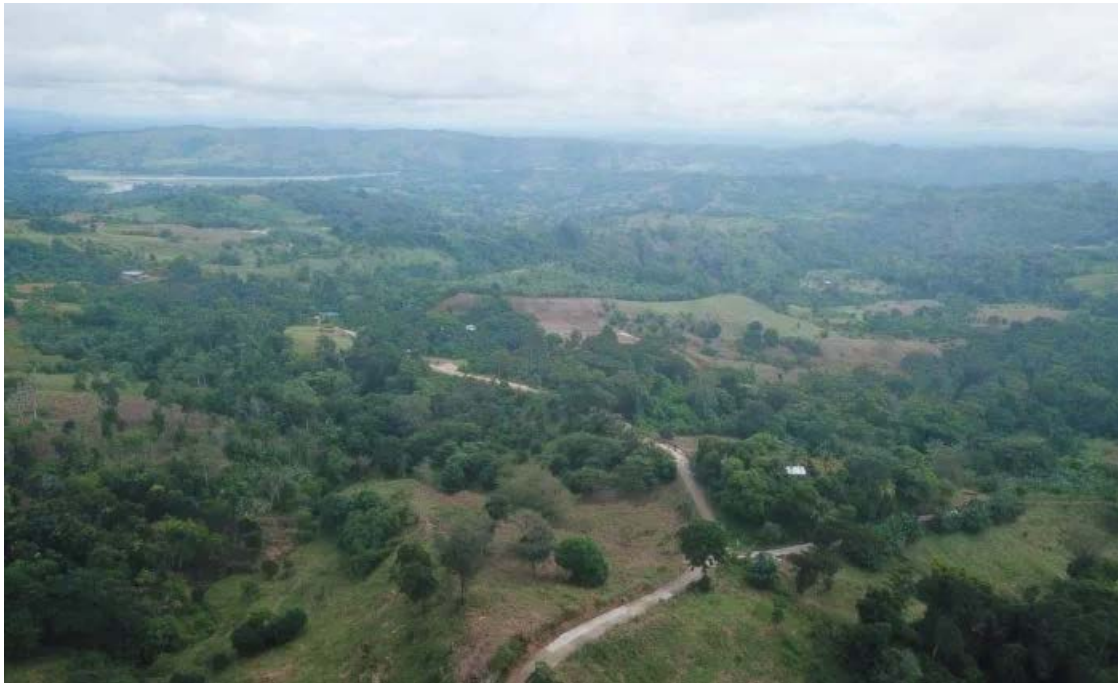
Photo shows a portion of the 12.5-kilometer Pinukpuk Junction-Pakawit-Binansagan farm-to-market road in Kalinga that will undergo improvements.

The ongoing FMR rehabilitation project is under the Department of Agriculture-Philippine Rural Development Project (DA-PRDP) Scale-UP in Pinukpuk town. It will directly connect the barangay of Pinukpuk Junction, Pakawit and Bayaw to the national road leading to the market center in Pinukpuk and Tabuk.