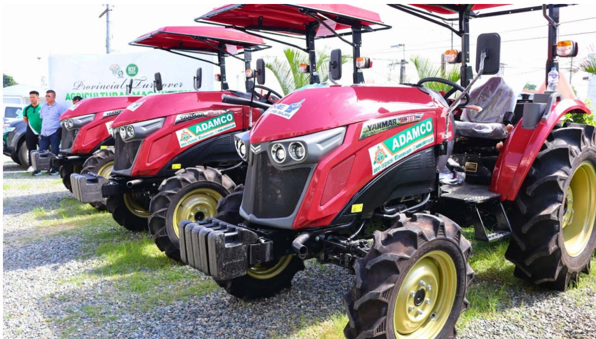
Photo shows the latest batch for farm machines distributed at no cost to beneficiaries in Ilocos Sur.

The Philippine Center for Postharvest Development and Mechanization (PHilMech) said that P32.49 million worth of farm equipment was distributed to the beneficiaries at the Provincial Farmers Livelihood Development Center in Vigan City, Ilocos Sur, on Tuesday.