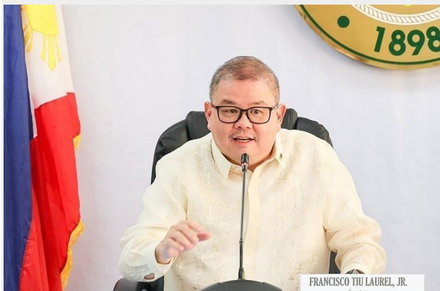
Agriculture Secretary Francisco Tiu Laurel Jr..