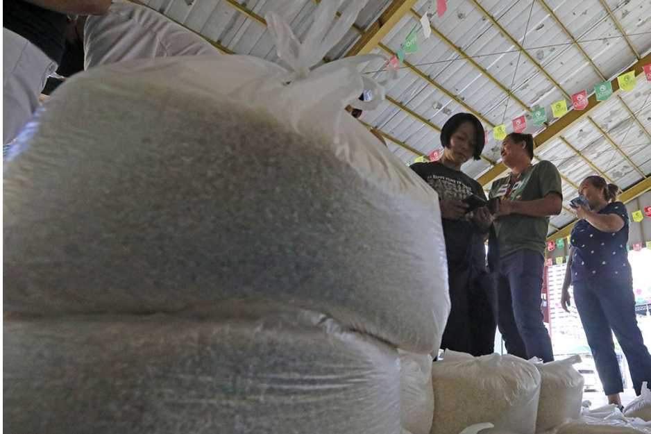
Rice is sold at a Kadiwa

Store inside the Bureau of Plant Industry (BPI) in Malate, Manila, May 30, 2024.