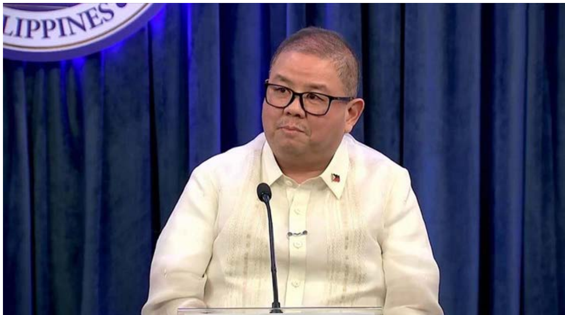
Agriculture Secretary Francisco Tiu Laurel Jr.

AGRICULTURE Secretary Francisco Tiu Laurel Jr. stressed the need to confront significant challenges that threaten tuna stocks such as climate change, overfishing, and illegal fishing practices.