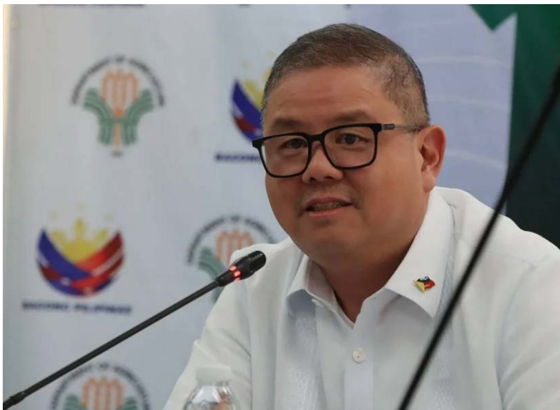
Agriculture Secretary Francisco Tiu Laurel Jr.

ACED is envisioned to lead the digital transformation of agricultural co-ops by using data analytics, online marketplaces, and climate adaptation tools — all aimed to enhance productivity and sustainability.