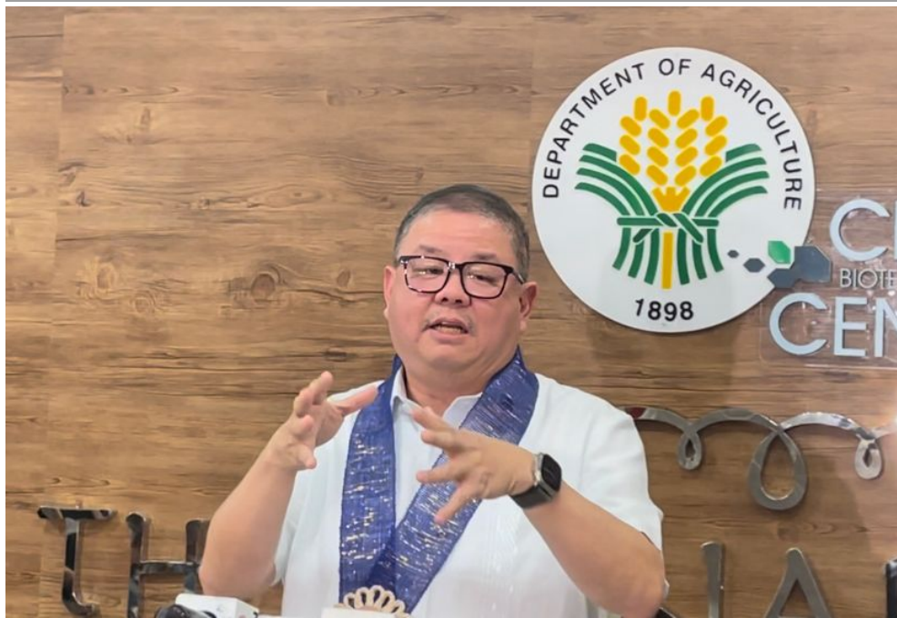
DA Secretary Francisco 'Kiko' Tiu Laurel Jr.

Department of Agriculture (DA) Secretary Francisco Tiu Laurel Jr. has directed the Bureau of Animal Industry (BAI) to extend the controlled testing of the African Swine Fever (ASF) vaccine to more areas across Luzon, as well as in red zones in the Visayas and Mindanao.