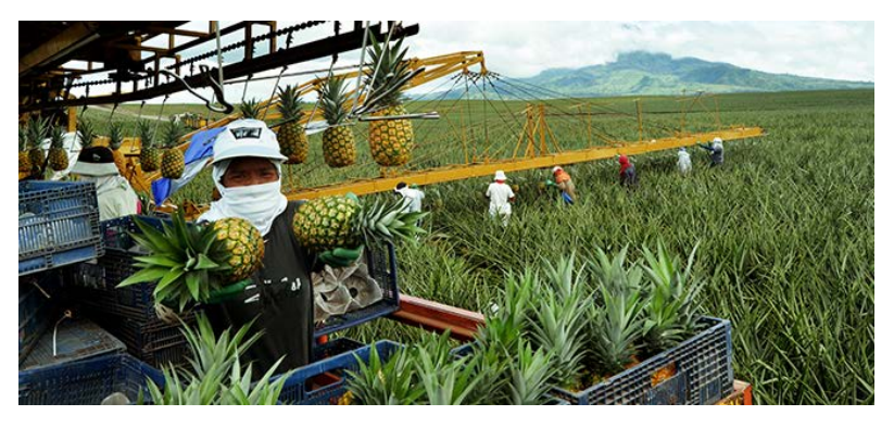
File Photo: Dole Philippines Pineapple Plantation

CHINA was the top buyer of pineapples from the Philippines last year, accounting for almost half of the volume it exported, the Food and Agriculture Organization of the United Nations (FAO) reported.