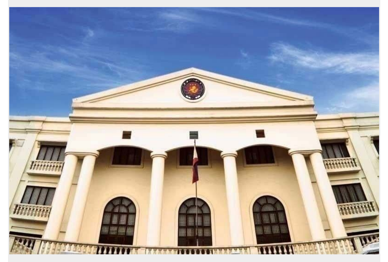
The top spenders of the 2024 budget as of June 30 are the following: Office of the Presidential Adviser on Peace, Reconciliation and Unity, National Intelligence Coordinating Agency, Department of Public Works and Highways, Department of Finance, Department of Foreign Affairs, Department of the Interior and Local Government, Commission on Elections, Department of National Defense, Department of Transportation and the Department of Agriculture.