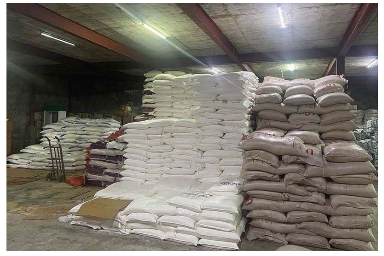
THE Sugar Regulatory Administration (SRA) said importing refined sugar is expected to allow traders to recover their costs and earn a small profit after shipping raw sugar to the US at a loss.

"Given that these traders (who participated in the US export trade) will also be given the chance to import refined sugar, the cost of money and other fees they incurred will probably give them just a little profit to recoup their expenses," the regulator said in a statement on Sunday.