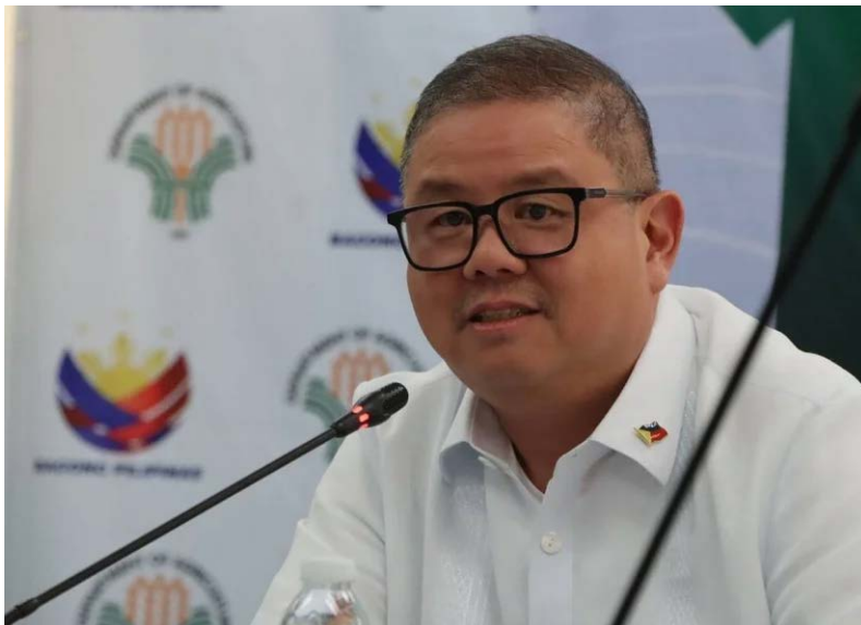
Agriculture Secretary Francisco Tiu Laurel Jr.

"This large-scale trial will gather data from farm to retail; that's why this cannot be done in a month or two months," Laurel said in a statement, citing plans to expand the P29 program to 1,500 municipalities across the country.