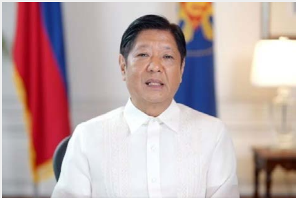
President Ferdinand Marcos Jr

MANILA, Philippines — President Marcos is expected to advance the country's position in the West Philippine Sea (WPS) when he addresses top military officials and experts from different parts of the world in Singapore next week, the Department of Foreign Affairs (DFA) said yesterday.