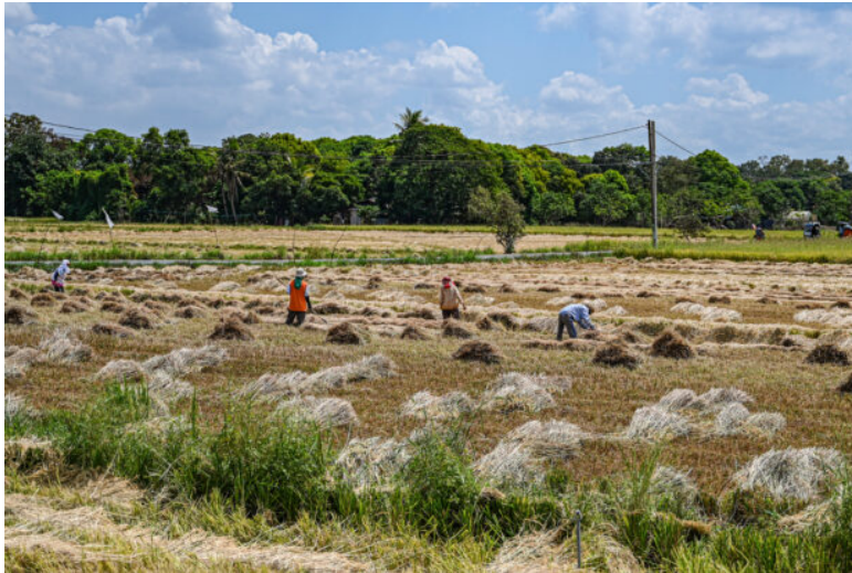
Farmers work in a rice field in Bulacan on April 24, 2024.

The Philippines is once again the world's largest rice importer, projected to import 4.1 million metric tons (MMT) this year, surpassing last year's import of 3.9 MMT. This projection, made by the United States Department of Agriculture (USDA), raises concerns and questions about the country's rice supply and consumption practices, despite the Department of Agriculture's (DA) claims that the impact of El Niño on rice production is minimal.