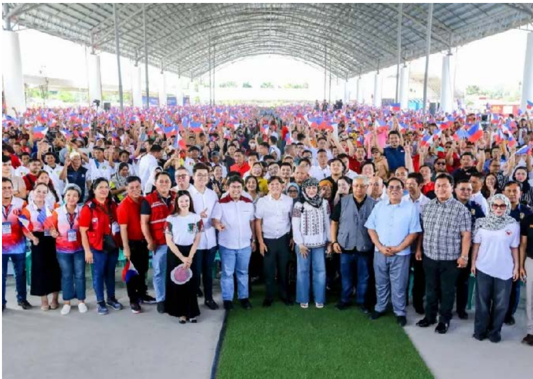
Over PhP30 million in cash assistance were personally extended by President Ferdinand R. Marcos Jr. to the fishermen and farmers affected by the El Niño phenomenon in Maguindanao del Sur, Maguindanao del Norte and Lanao del Sur on Thursday.

"As June approaches, the extreme heat would be replaced by heavy rains. This is why I'm ordering all government agencies to continue coordinating with LGUs as preparation for La Niña," he said.