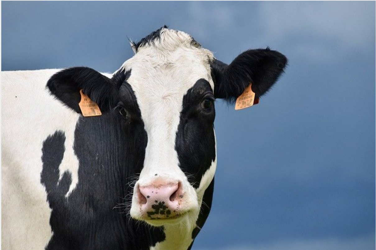
A dairy cow