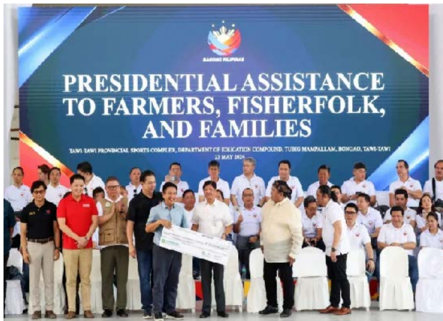
President Ferdinand R. Marcos Jr. leads the distribution of presidential assistance to farmers, fisherfolk and families at the DEPED Gymnasium, Brgy. Tubig-Mampallam, Municipality of Bongao, Tawi-Tawi province on Thursday, May 23, 2024.

During the occasion, Marcos gave the provincial governments of Tawi-Tawi and Basilan P10 million each in assistance to alleviate the effects of El Niño.