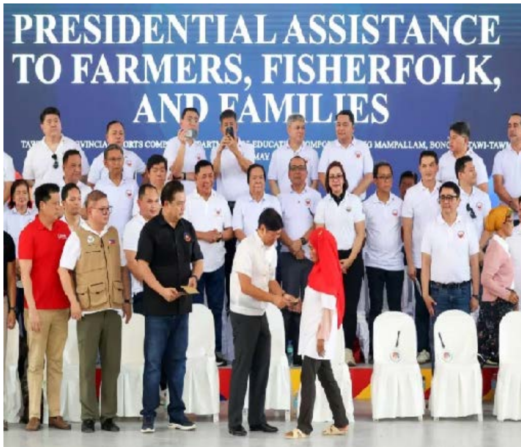
President Ferdinand Marcos Jr. leads the distribution of assistance to farmers, fisherfolk and their families at the Department of Education (DepEd) Gym in Bongao, Tawi-Tawi on May 23, 2024.

https://www.manilatimes.net/2024/05/24/news/national/marcos-vows-to-sustain-mindanao-devt/1948120